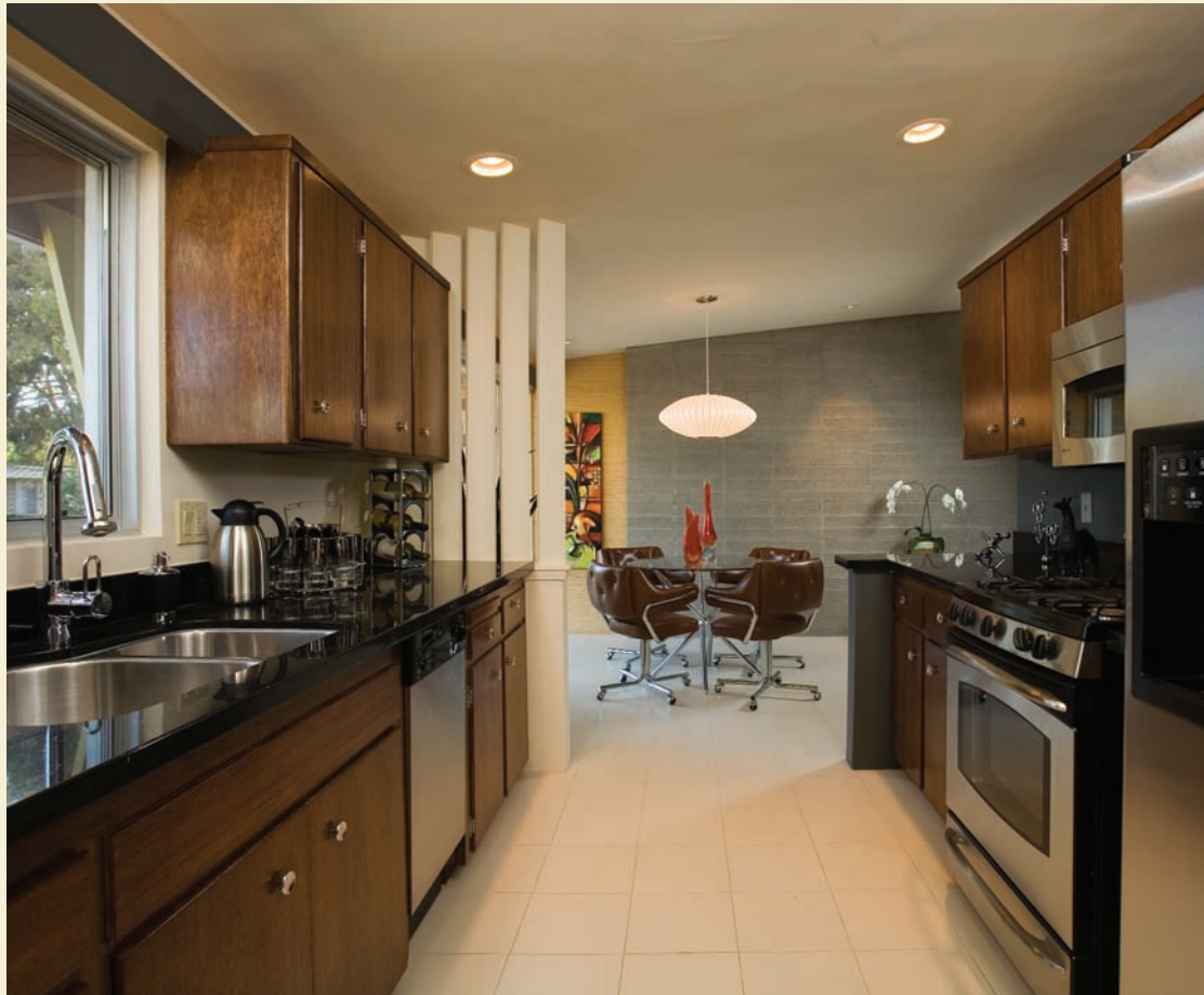
Original Philippine ribbon mahogany cabinetry was revamped and jazzed-up with Black Galaxy granite countertops and stainless steel appliances. The concrete block wall was constructed and sandblasted to create a visual continuation of the outdoors coming inward.

IN A QUIET CUL-DE-SAC SURROUNDED BY SMALL URBAN FARMS IN NORTH PHOENIX, THIS unassuming ranch home was slowly stripped of five decades of wear then chiseled and reshaped into a contemporary earth angel by one of the most discriminating tastemakers of our time, environmental designer Troy Bankord.