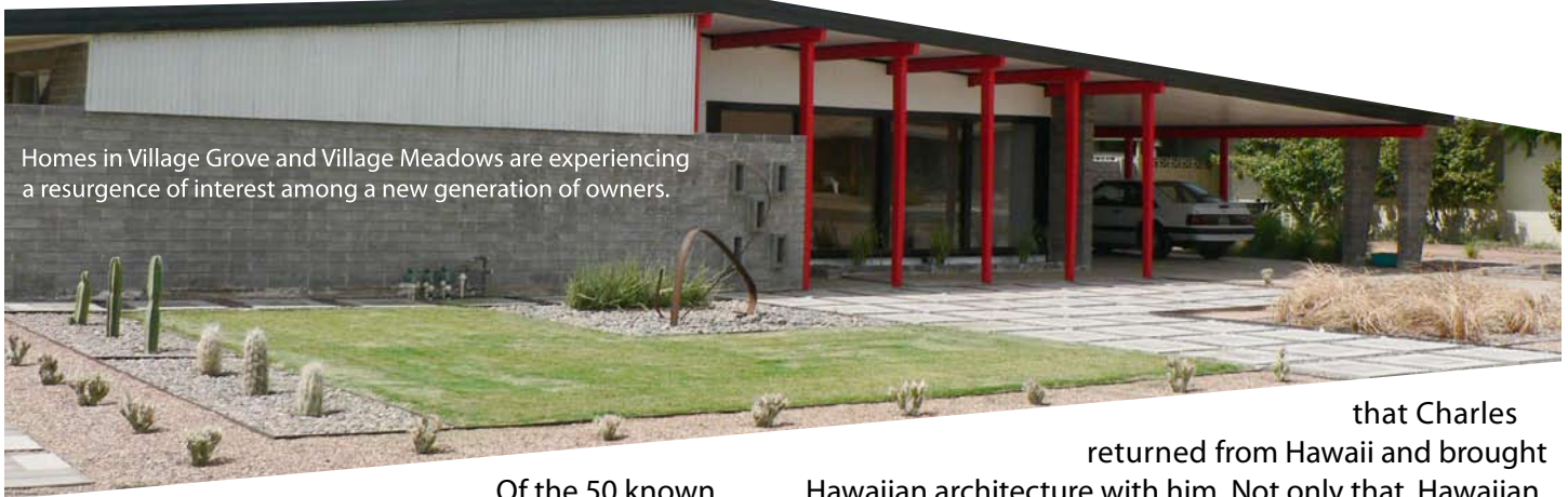
Homes in Village Grove and Village Meadows are experiencing a resurgence of interest among a new generation of owners.

Of the 50 known houses there are minor variations in the original build. The most intriguing variation is the 'mark', the fenestrated block configuration near the front door, always with one of two patterns. The Five-Spot Domino pattern is predominant in Village Grove, and the Three-Slot pattern can be seen elsewhere. This mark may indicate some difference in the floorplan or vintage. There are other more significant variations, for instance the number of columns out front, the width of the entry, the height of the front windows or the inclusion of a rear patio also tucked in under the roofline.