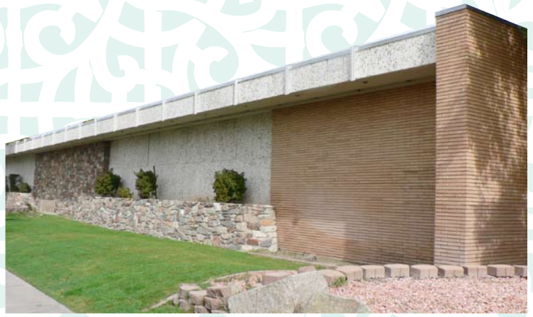
The Schreiber Brothers Office Building on Central Avenue has a striking desert masonry facade and brilliant green terrazzo.

developments, the Schreibers developed a different kind of design intelligence, a different set of muscles. Economies of scale affect design. In a one-off custom house, overbuilding, miscalculating, or turning a single two-by-four 45 degrees for a bit of structural efficiency wouldn't matter, nobody would care. But when you set up to construct 3000 iterations of that design, it makes one helluva difference. Their attention to mass-production simplicity, affordability, and buildability issues was arguably more related to the wellsprings of modernism than any other familiar name in Phoenix architecture.